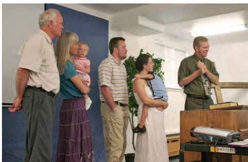
Two children belonging to a Deaf couple are dedicated to God during a Deaf camp meeting.

Just be a true friend to your Deaf neighbor or relative. Over time, share with them the immense love of Christ. Share your personal experiences in this walk with God. Your winsome character and personality and your true interest in them as people will be the most effective way to bring them to Jesus.