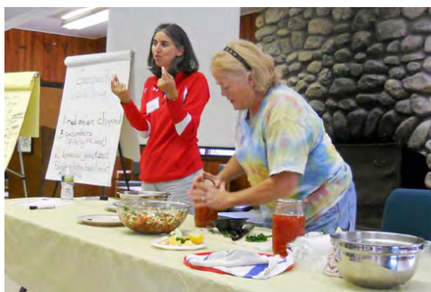
Deaf Camp Meeting attendees enjoy a healthy cooking demonstrations.

Believe me, Mom's experiences are not unique to her. As I visit with Deaf Adventist friends, I hear the same story over and over, just like a broken record. The names are different, but the experience of loneliness and frustration are the same. Many Deaf people all across North America are still struggling, all alone, in their spiritual journey. This shouldn't be.