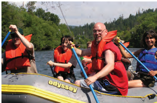
Deaf making memories and lasting friends while rafting on a river during a Deaf camp meeting.

E-mail, text messaging, and social networking also fosters friendships. Communicating with one another regardless of distance has become easy. Therefore, your member at home can be a part of the large group of Adventists from coast to coast.