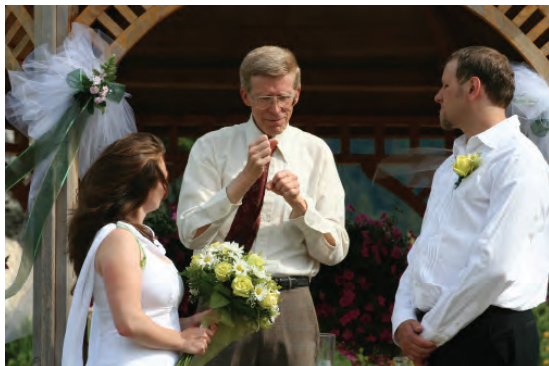
A signing pastor shares a message during a wedding ceremony for a Deaf bride and groom.

if you had to sit through songs that were sung in a monotonous, raspy voice, in broken English, missing words, and lacking any sense of rhythm. That is how many songs come across in sign language! Moreover, many things are often lost in translation as two vastly different worlds and ways of expression are being bridged. Because ASL has its own grammar and vocabulary, interpreters have to edit and translate the meaning of the sermons on the fly. Deaf people will never be able to experience a hearing church the same way you do.