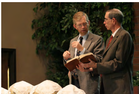
A Deaf pastor reads a passage during Communion Service.

and fellowship experience. Worshipers all sign their praise to God in congregational songs. The message and all information shared are in sign language, their native tongue. Also, Deaf people best learn interactively. In a Deaf church, they are free to ask questions, seek clarification, and discuss meaning together. In the hearing church setting, often deaf people are objects of someone else's ministry. In a Deaf church, each person is free to use their spiritual gifts, talents and passion to serve in the Lord's work. What a better way to learn and share!