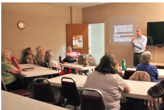
Evangelism meetings in ASL help Deaf to grasp Bible truths.

Additionally, today's technology now allows Deaf people to chat and even study the Bible face-to-face via video phones, laptops, and cell phones.