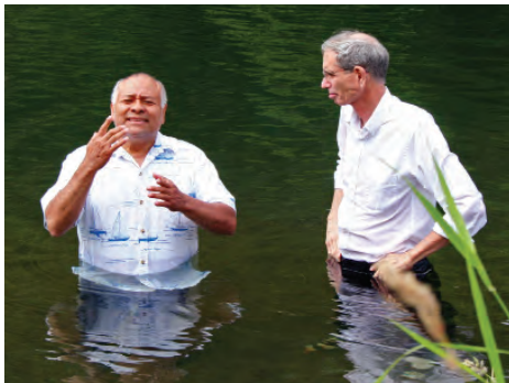
A Deaf man shares his testimony before being rebaptized.