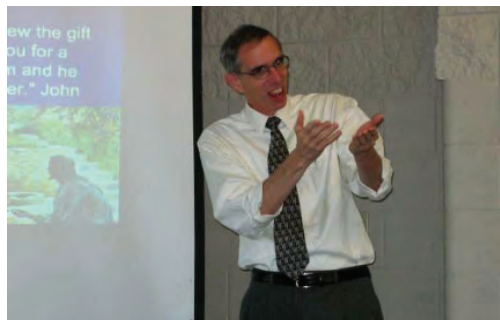
The Deaf deeply appreciates seeing a sermon in their own language.

The spiritual journey has not been easy, however. Like many Deaf, Mom had to slowly learn Biblical instruction. She endeavored to study the Bible, although English is her second language. Very few hearing people have taken the time to study with her. For years, I saw my mom's loneliness in church services. While the church members patted themselves on the back for learning how to sign "Happy Sabbath," my mother mourned that