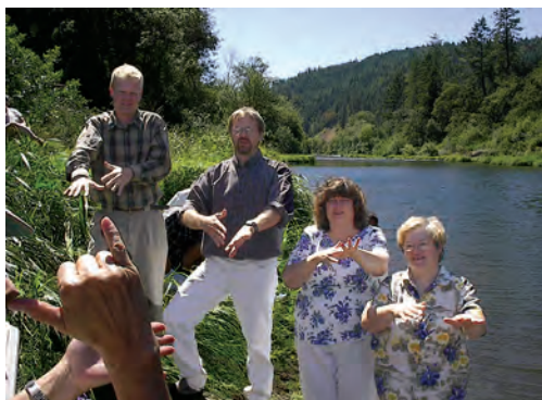
A Deaf choir sings Shall We Gather at the River for a baptism.

We're going to have to put aside our own