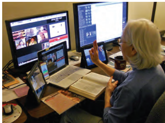
Deaf Bible School instructor studies with several Deaf people around the USA simultaneously using an online video service.

Bible School —Deaf people may study the Bible via internet,